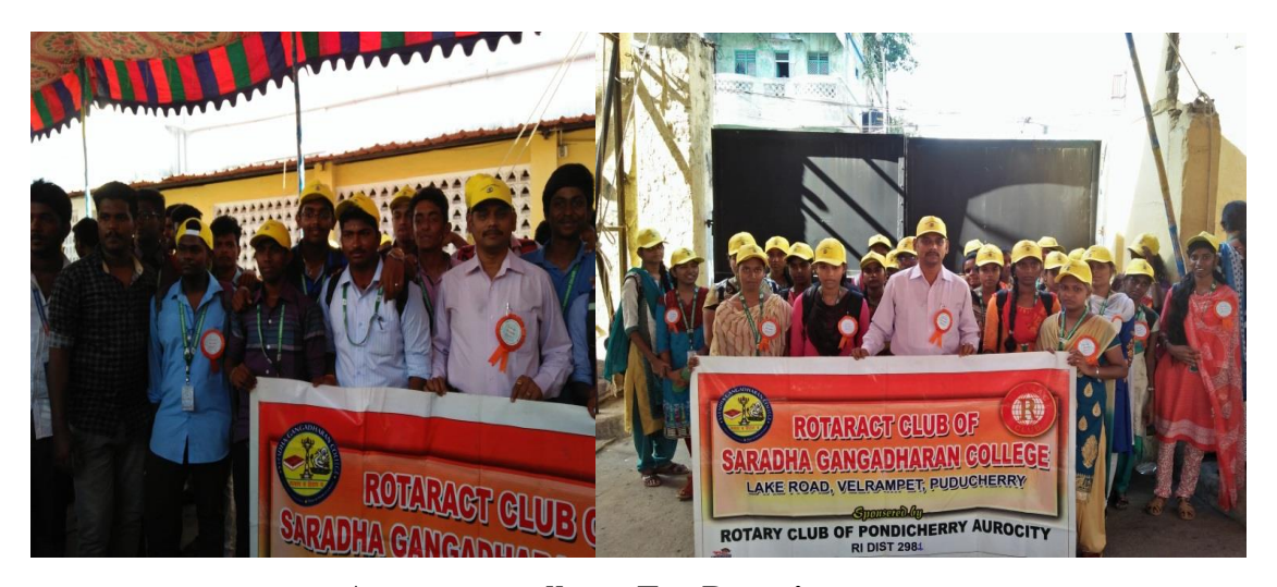
Awareness rally on Eye Donation

The rally started off from Raja Theatre Signal to Mahatma Gandhi Statue, Beach road. More than 100 students pronounced the slogan for awareness for eye donation.